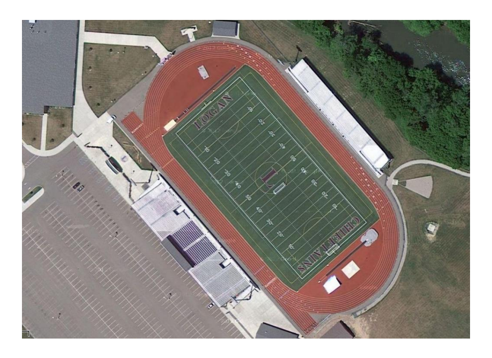
Aeriel view of "The Chief"

Logan Chieftain Stadium is a state of the art multi-purpose stadium located on the campus of Logan High School ideally located just off US33 south of Logan. Built thanks to a bond issue passed in conjunction with a bond issue that financed the new Logan High School, Logan played its first varsity football game at the new facility at the start of the 2008 season.